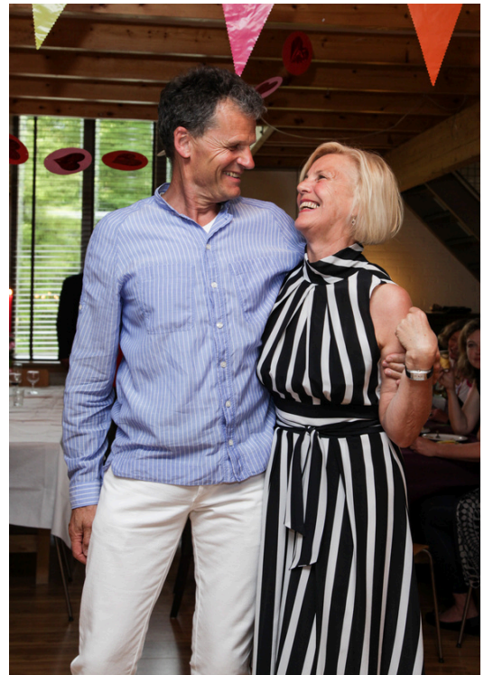
Graduation in 2013