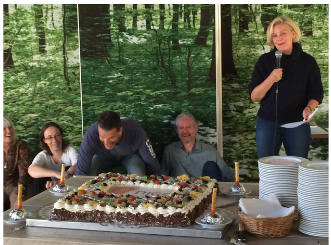
New logo and celebration of 10 years 2015