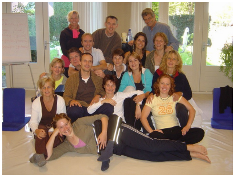
Opening and first group in 2005