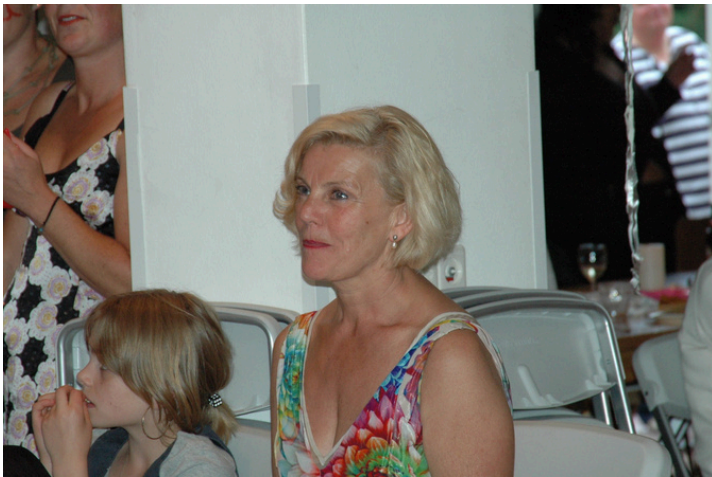
First graduation in 2009